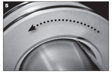
Rotate the seal in the direction of the shim overlap and slide over the shaft.

CAUTION: Rotate the seal in the direction of the overlap to avoid lip damage.