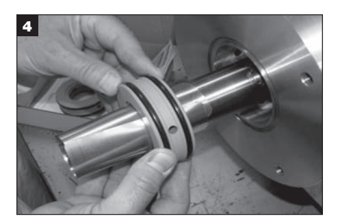
Position the shim and the seal over the shaft.