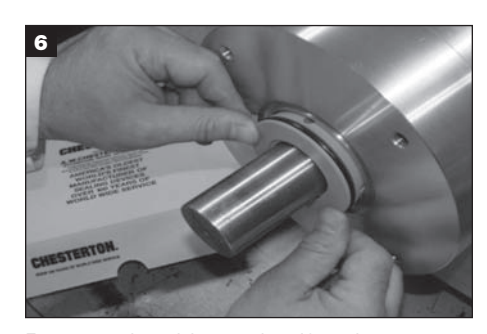
Remove the shim and uniformly press the seal into the bore.

CAUTION: Rotate the seal in the direction of the overlap to avoid lip damage.