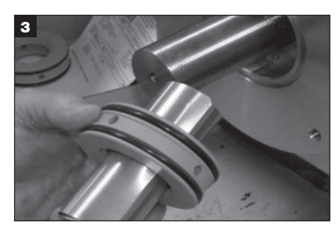
Roll the shim stock and carefully pass through the seal.

NOTE: Lubricating the seal lips slightly facilitates installation.